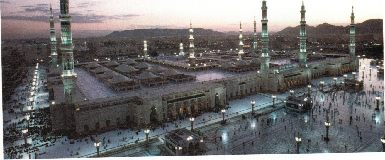
The Prophet's Mosque in Madinah holds Muhammad's tomb.