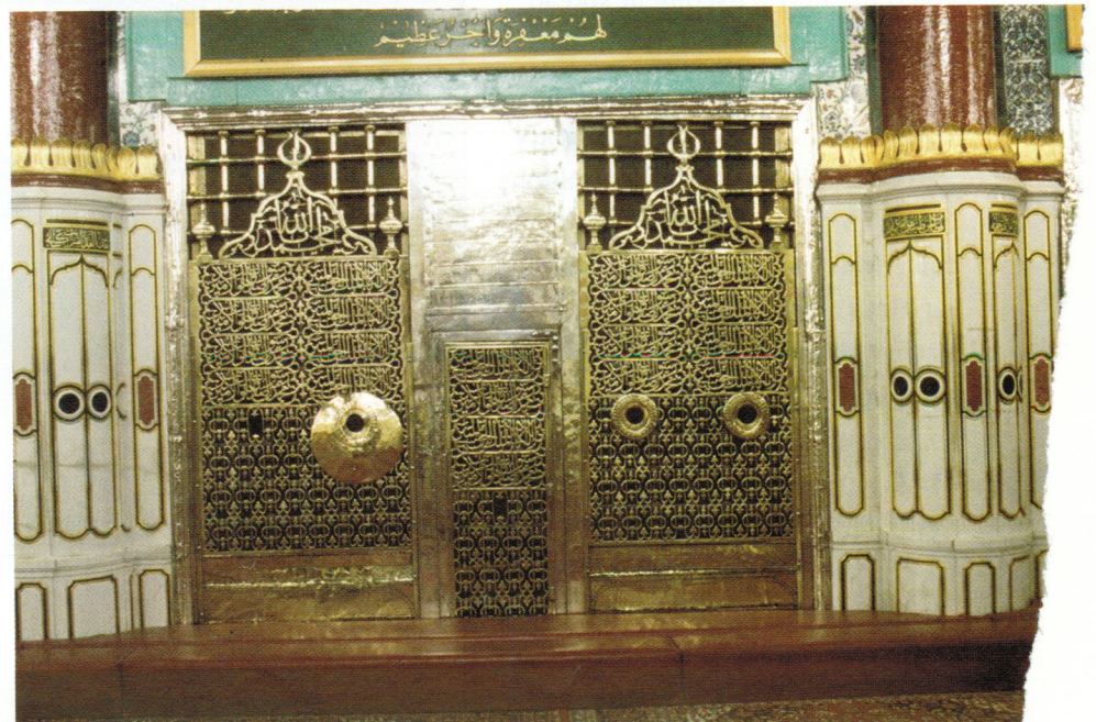
The first two caliphs, Abu Bakr and Umar, are buried on either side of Muhammad's tomb.

Muslims held on to land in Spain, where Muslim states lasted for almost 800 years. Muslims in Spain built some of the greatest cities of medieval Europe. Their capital city, Cordoba, became a center of learning where Muslim, Jewish, and Christian scholars shared ideas. Through their work, Muslim Spain made amazing advances in arts, science, technology, and literature. You will learn more about the accomplishments of Islamic civilization in Chapter 10.