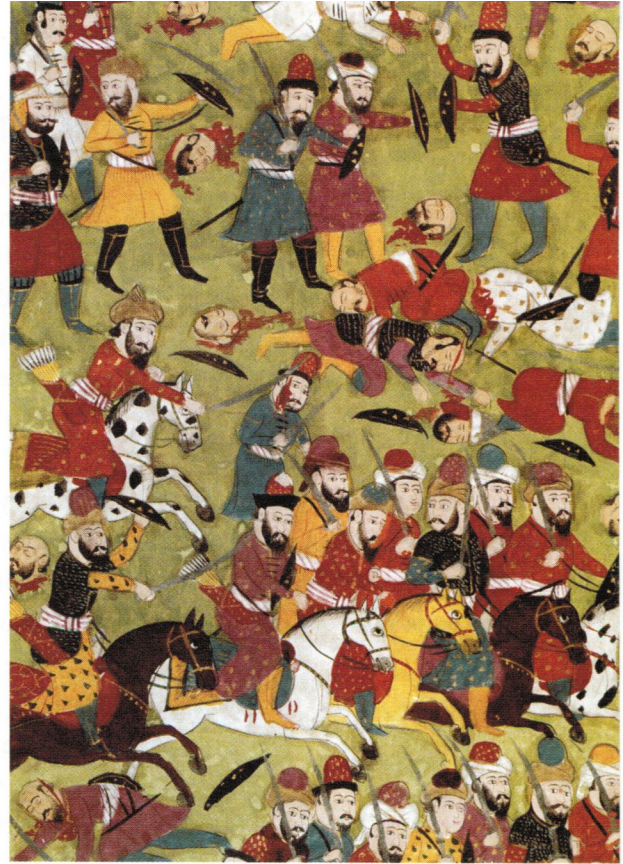
The fourth caliph in the Muslim government fought against rebellious Muslims who challenged his rule.

Ali ibn Abi Talib, Muhammad's cousin and son-in-law, reluctantly agreed to become the fourth caliph. Some Umayyads challenged his rule, drawing the Muslim community into a civil war. Ali sent forces against them. When he ended the rebellion through negotiation, some of his supporters disapproved of his action. In 661, one of them murdered Ali.