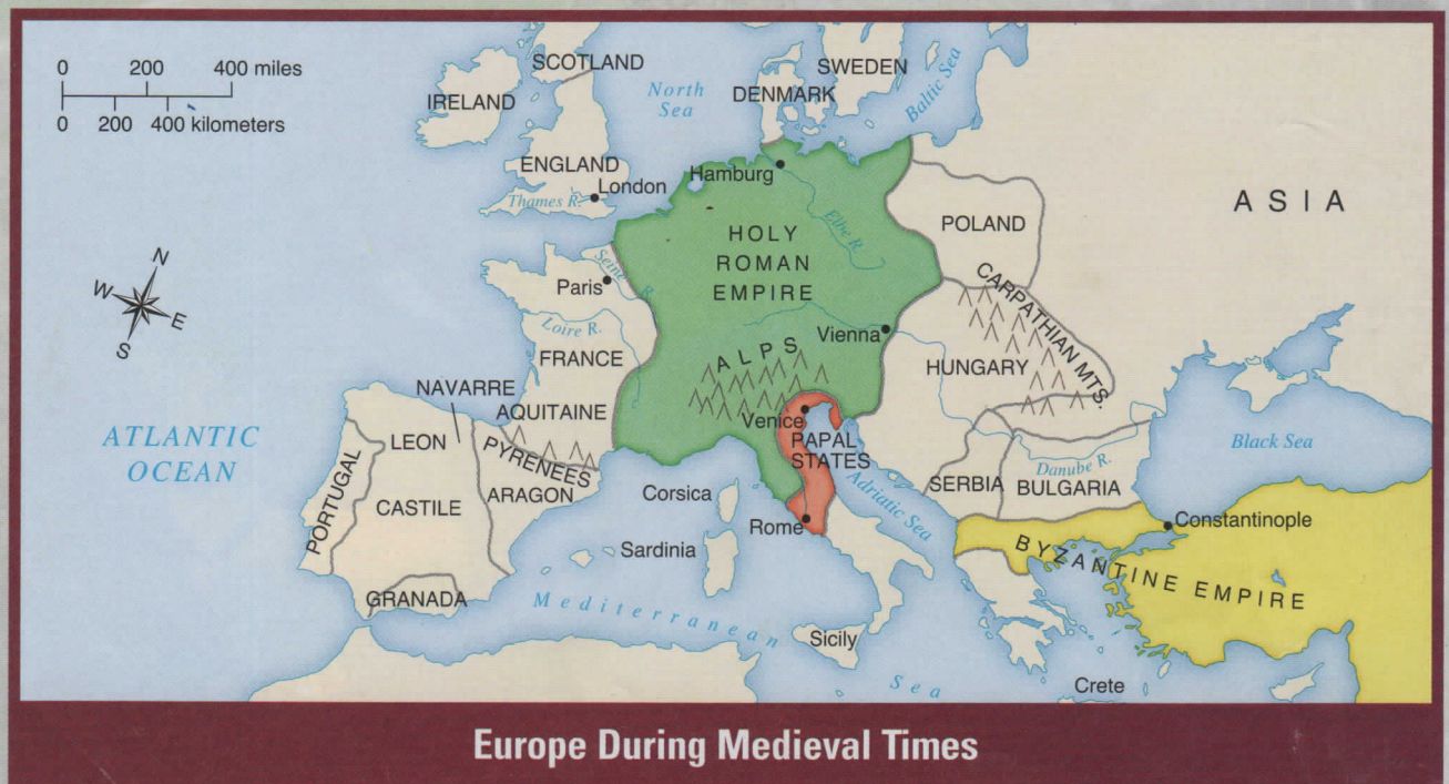
Europe During Medieval Times