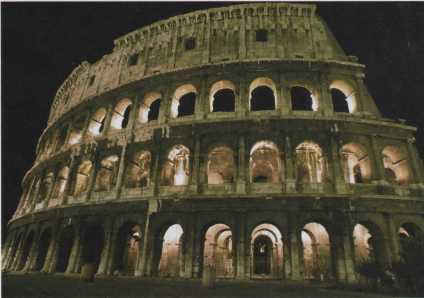
The ruins of the Roman Colosseum, where gladiators fought for the entertainment of spectators, still stand in Rome today.

celebrates the victories of the French emperor Napoleon in the early 1800s. Today it is the national war memorial of France.