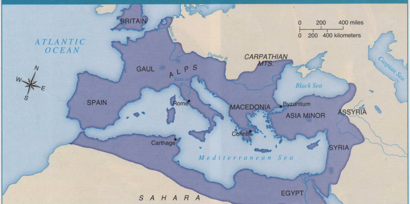
The Roman Empire at Its Height, About 117 C.E.

In western Europe, Rome's fall did not mean the end of Roman civilization. The influence of Rome lived on through the medieval period and all the way to our time. As you read about the legacy of the Romans, think about how ideas and events from the distant past still affect us today.