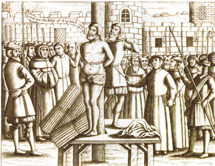
Writer and scholar Tyndale was burned at the stake for his Protestant views.

Tyndale was especially important for his translations of books from the Bible. To spread knowledge of the Bible, he translated the New Testament , and parts of the Old Testament , into English. In the early 1600s, his work was used in the preparation of the King James, or Authorized, Version of the Bible. Famed for its beautiful language, the King James Bible had an enormous influence on English worship and literature.