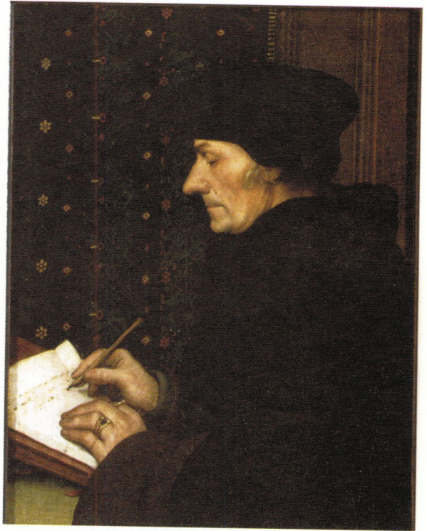
Catholic priest Erasmus of Holland was perhaps the most influential person in spreading the ideas of reform before the Reformation.

Erasmus wanted to reform the church from within. He angrily denied that he was really a Protestant. Yet perhaps more than any other individual, he helped to prepare Europe for the Reformation. His attacks on corruption in the church contributed to many people’s desire to leave Catholicism. For this reason it is often said that “Erasmus laid the egg, and Luther hatched it.”