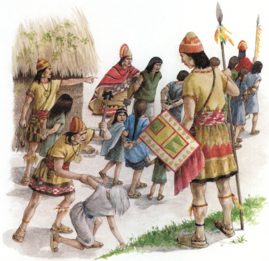
Inca soldiers lead captive people away from their homelands to be resettled elsewhere in the empire.

Many historians have wondered what drove the Incas to conquer such a huge empire. Part of the answer may lie in a unique Inca belief. The Incas thought that even after death, the Sapa Inca continued to rule the lands he had conquered. In order for the new emperor to establish his own source of power and wealth, he had to take new lands. Only then would he have land that belonged to him alone.