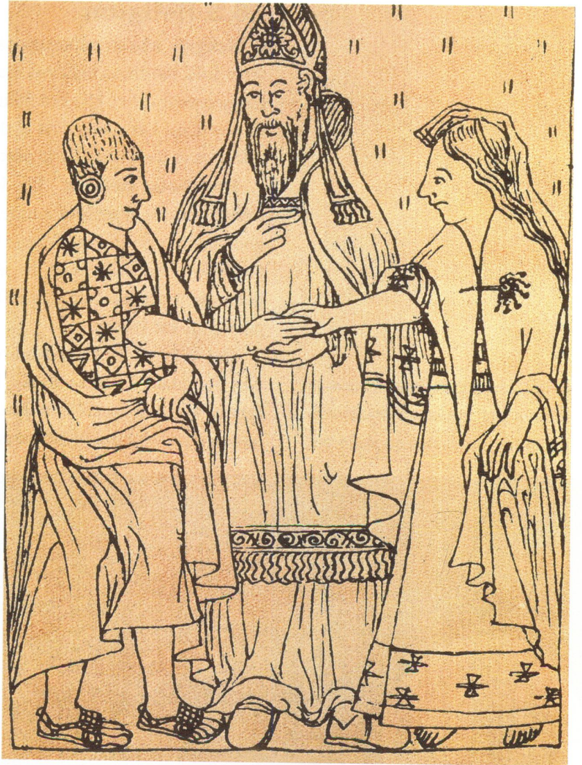
Inca couples agreed to marry by holding hands and exchanging sandals.

Once they were married, couples established their own homes. Commoners typically lived in one-room houses made of adobe brick or stone. Noble families had fancier houses with several rooms. While nobles enjoyed the help of servants, commoners worked hard to produce their own food and clothing and to fulfill their responsibilities to the ayllu.