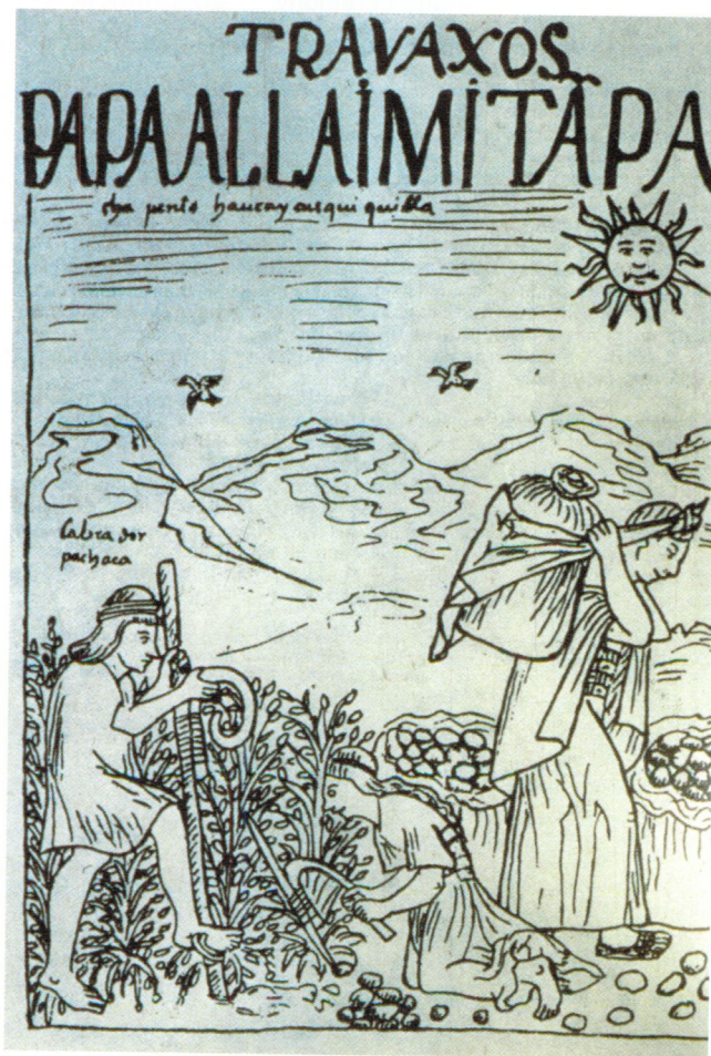
In this illustration, dating from about 1565, Inca farmers harvest potatoes.

Inca farmers were required to give most of their crops to the government. The government placed the crops it collected in storehouses throughout the empire. The food was then distributed to warriors, temple priests, and people in need. For example, the government gave food to people who could no longer work, particularly the aged, the sick, and the disabled.