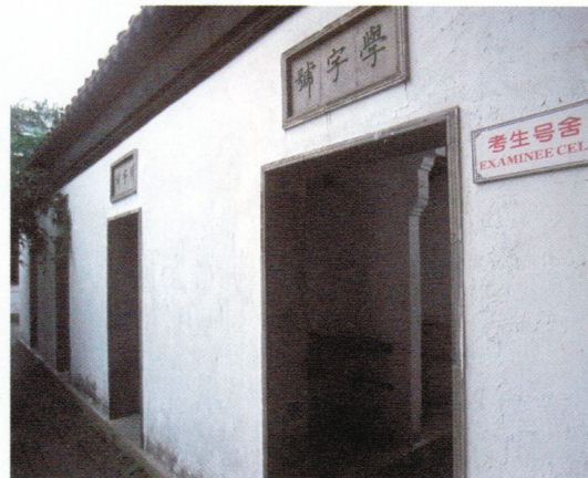
Civil service exams lasted for several days. Candidates were locked in small cells like these during the tests.

Yet China's civil service system may also have stood in the way of progress. The exams did not test understanding of science, mathematics, or engineering. People with such knowledge were therefore kept out of the government. Confucian scholars also had little respect for merchants, business, and trade. Confucians had often considered merchants to be the lowest class in society because they bought and sold things rather than producing useful items themselves. Under the Ming, this outlook dominated, and trade and business were not encouraged. In addition, the bureaucracy became set in its ways. Its inability to adapt contributed to the fall of the Ming in 1644.